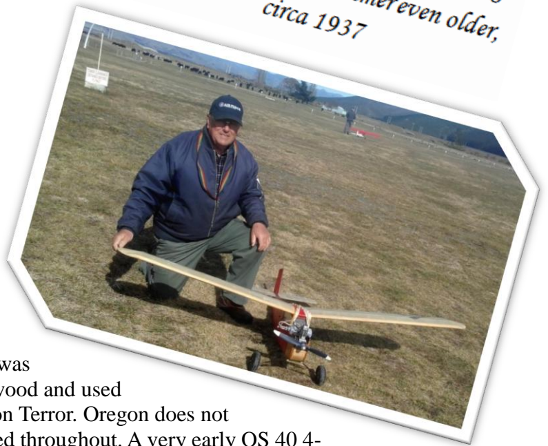
The 2-wheeled old-timer circa 1938 and the 2-legged old-timer even older, circa 1937