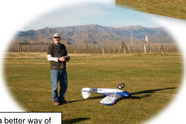
and a better way of hitting the spot...